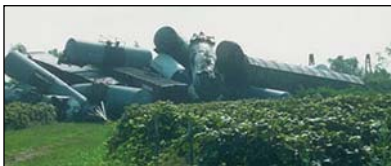
Train Wreck – 1997 ConRail Train derailment in West Dunkirk