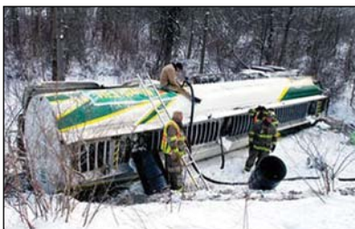
Hazardous Materials Response Team drill tanker in preparation of offloading gasoline from this overturned tanker On Rt62 in Kiantone.

The Chautauqua County Hazardous Materials Response Team is an all-volunteer, highly-trained group of firefighters who respond to incidents involving hazardous materials throughout the entire county.