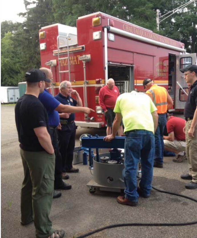
Midland2 HM team members review proper application of Midland Emergency Response Kit (ERK) with their rail car valve simulator