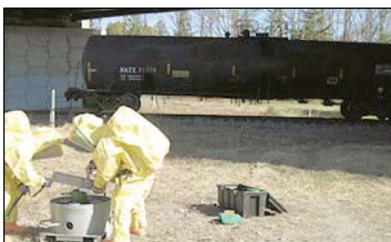
April 2013 - Chautauqua County Hazardous Materials Response Team conducts drill on leaking rail car at St Bonaventure with its regional partners: Cattaraugus and Allegany Counties and the Seneca Nation of Indians.