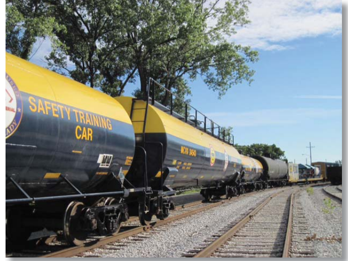
HM 003 CSX Safety Training Train

Anyone interested in finding out more about the team should feel free to attend any of our drills or contact Dan Infeld at 410-4263