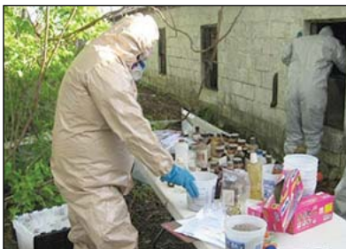
Chautauqua County Hazardous Materials Response Team renders safe abandoned lab with the help of the Ashville Fire Department and the Sheriff’s Dept Bomb Team.