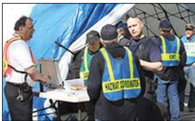
CST Drill – May 2013 as part of the State “Storm West” exercise the HazMat Conducts exercise with the NYS National Guard Civil Support Team (2nd CST) and Chautauqua Fire Department